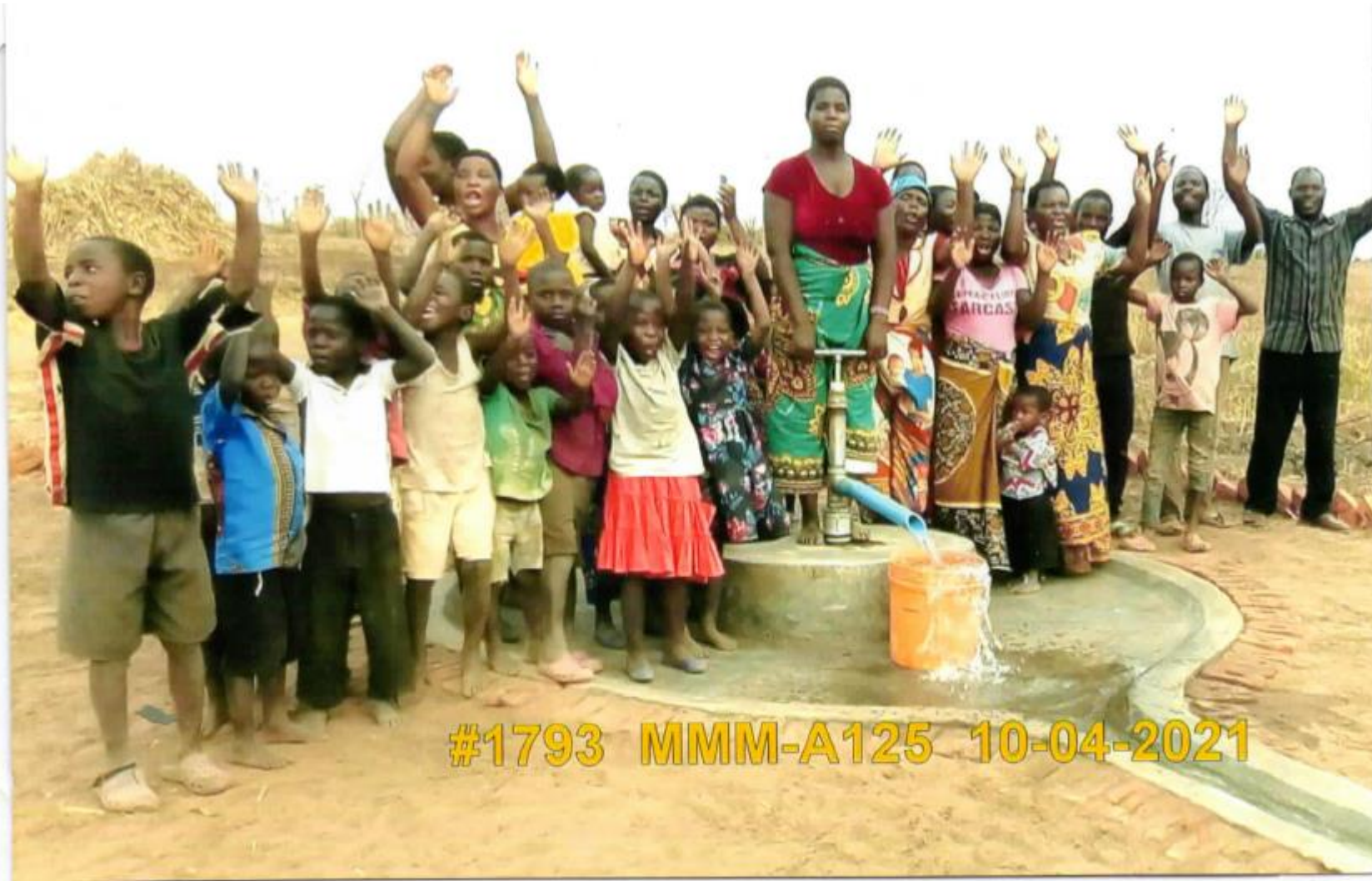
Life-giving water flows for this village.